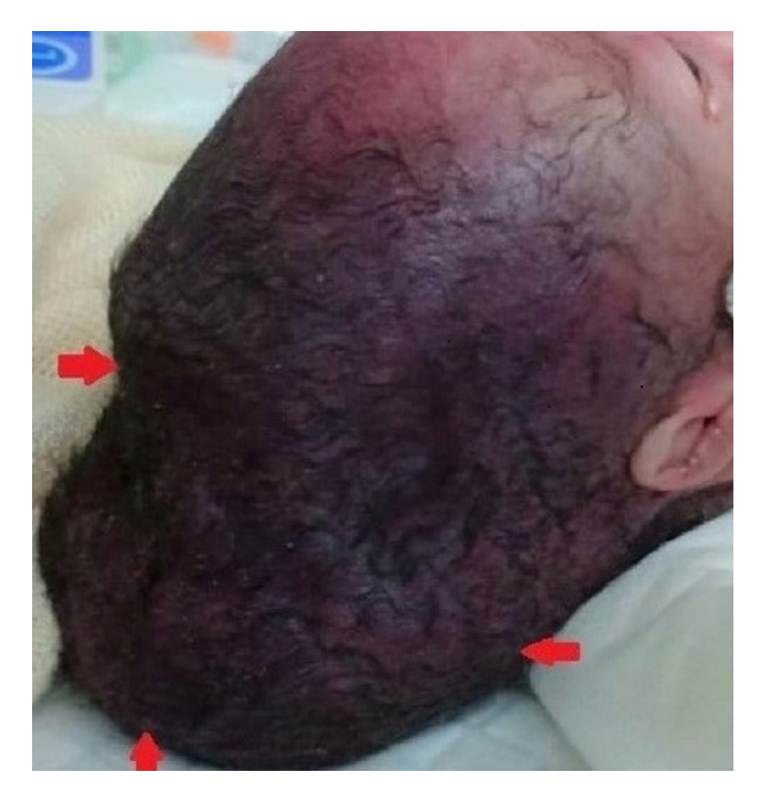
Figure 1. Significant SGH in the dependent occipital region SGH: Subgaleal hematoma

SGH is a rare but potentially lethal condition occurring in newborns that typically complicates traumatic delivery, particularly after vacuum extraction or forceps delivery (1). SGH affects approximately 40-60/10,000 deliveries, with a mortality rate of up to 25% of cases (2). Significant blood loss may accumulate between the skull periosteum and the galea aponeurotica secondary to rupture of emissary veins. This unlimited potential space may contain the whole