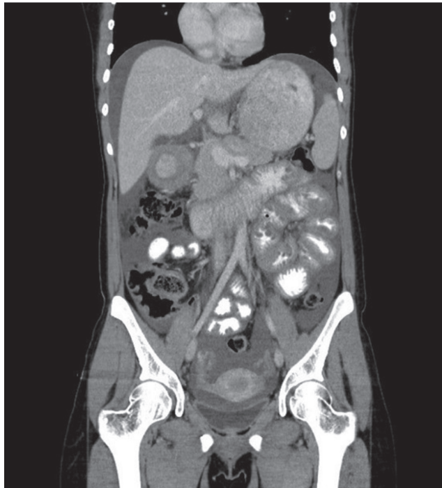
Figure 1. Abdominal computed tomography showed moderate ascites with thickening of the gastric antrum and small bowel walls

As a consequence, a diagnosis of eosinophilic gastroenteritis was made. She was treated via the elimination of milk and milk products from the diet and proton pump inhibitor administration. Her abdominal pain, acid and examination findings were completely resolved